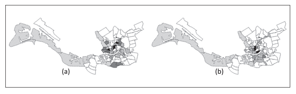
Figure 2. Distribution of Authorized (Left) and Unauthorized (Right) Eastern Europeans Across Rotterdam